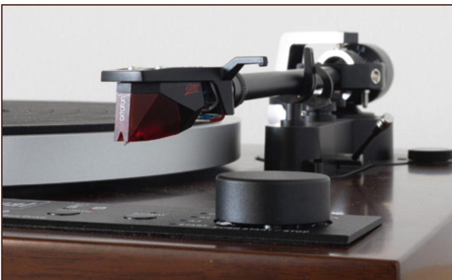
Dual includes the 2M Red from Ortofon as a cartridge. You can find a test of this and other cartridges on pages 62 to 66

CS 529 with Bluetooth and an integrated phono stage. On the one hand, you can connect the record player to Bluetooth headphones or speakers. All you have to do is put both devices into pairing mode, and the connection is paired in no time. The second function of the pairing button is an absolute novelty. The Dual CS 529 is, as far as we know, the first record player with an app. The CS 529 app turns the smartphone into a remote control, allowing us to remotely control all of the functions mentioned above from the comfort of our sofa. This actually works completely smoothly and lightning fast. That's real convenience and a statement to the competitors! The fully automatic system works not only with records in the classic 12-inch format, but also with 7-inch singles. In order for the CS 529 to know which size is on the record, you have to flip a small lever on the tonearm base. Records in a 25 centimetre format – i.e. 10 inches – cannot be played fully automatically. But you don't have to use the convenience features. You can also put the needle on yourself. If we move the needle over the vinyl, the platter starts to rotate automatically.