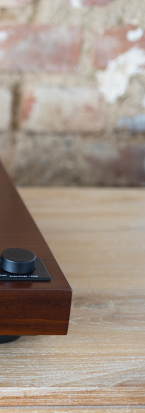
table uses a belt drive. A ground belt is used for better synchronization. The belt transfers the torque from the motor to the turntable. The motor uses direct current (DC). The speed is optically recorded and controlled, which enables a constant rotation speed. To ensure that the motor is decoupled from the rest of the system, it sits in a vibration-damped mount.

The turntable is made of die-cast aluminum and measures 30.5 centimeters in diameter. It sits on a hardened steel axle, which in turn is inserted into a precision brass bushing. The frame, platter and motor alone do not make a turntable, however, the tonearm is missing. With the CS 529, Dual uses a fully gimbal tonearm. Four fine pivot ball bearings are used. The bearing construction is made of massive aluminum. The tonearm makes a solid impression and offers sufficient adjustment options.