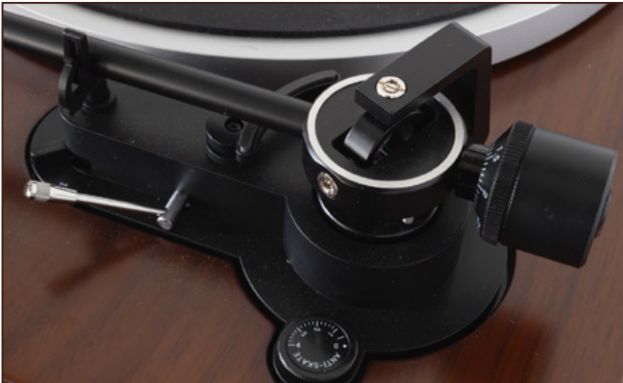
The fully cardanic tonearm is anchored in a pivot ball bearing, which is made of solid aluminum