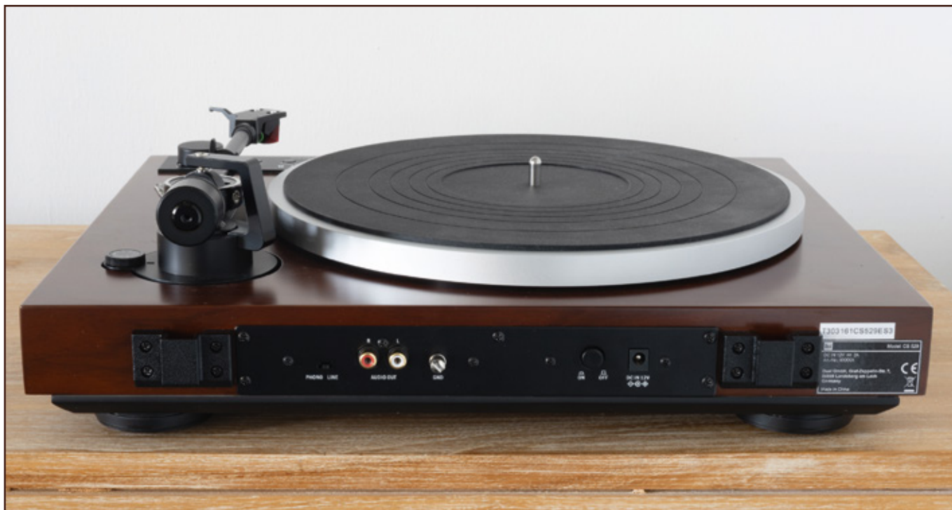
The CS 529 has an integrated phono preamplifier, which can also be deactivated if required

beginning of 2022, after which singer Isaac Wood left the band. The closer „Basketball Shoes“ is a 12-minute piece consisting of three parts. It starts very cautiously with quiet, slowly increasing guitars. Here the CS 529 proves its great talent for a dynamic performance. It transports the low-level attacks into the room with astonishing subtlety. The song contains a very spatial drum recording. The direct signals of the individual drums are practically inaudible. The drums are wide, spacious and a bit dirty in terms of sound. This spatial information is reproduced well and very naturally by the fully automatic machine. At around the 3.5 minute mark, Isaac Woods' emotional vocals begin. They sound round and full. Brass and strings then open up the entire width of the stage, after which the composition collapses. In the second part, the CS 529 presents crisp and lively transients. The percussive elements are very tangible and even the somewhat wild passages are cleanly sampled. We move on to the last act of the title, which is very similar to the first, but much more theatrical and dramatic. Distorted guitars, an opera choir and deep basses suit the Dual record player just as well here.