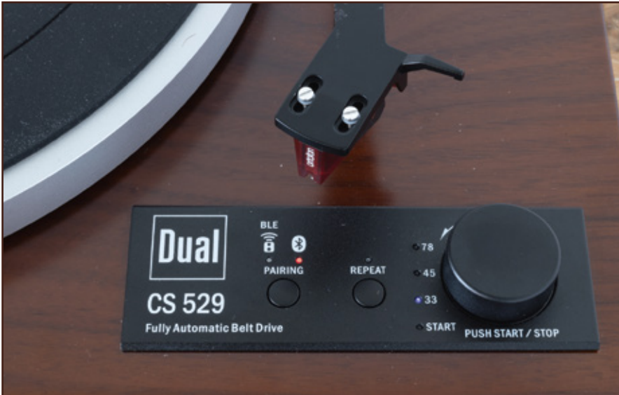
The fully automatic turntable is easy to operate. A control knob and two buttons, that's all you need