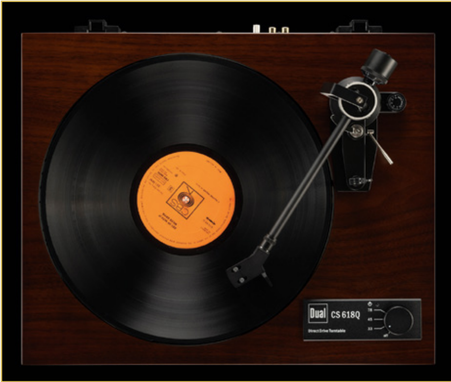
The ease of use is excellent. We can adjust the speed in three steps using the rotary switch

Town”, originally sung by the legendary Frank Sinatra, is performed in our test in a version by Al Saxon. This homage to Chicago sounds lively, colorful and full of energy. The pronounced spatiality with which the song is reproduced is particularly remarkable.