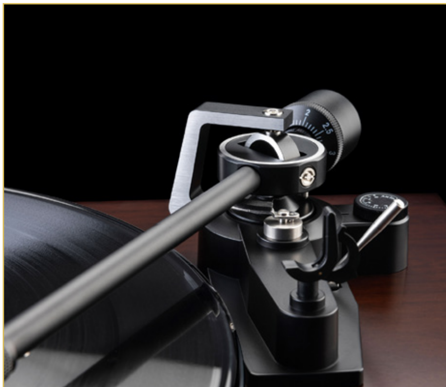
The tonearm suspension is fully gimbal-mounted and features four pivot ball bearings, allowing the tonearm maximum freedom of movement

The turntable has RCA jacks and can be connected to both phono and high-level inputs. An external plug-in power supply supplies the device with power. Overall, the CS 618Q, like other Dual models, is timelessly chic. Clear edges and a straightforward appearance speak the unmistakable design language of the traditional German company. The turntable's appearance is rounded off by the stylish acrylic glass lid. It can be mounted without much effort using the usual plug-in hinges. However, we will not be