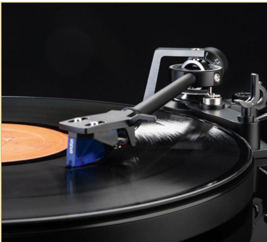
The CS 618Q comes equipped with the Ortofon 2M Blue cartridge as standard. A well-matched partner for the turntable

We continue our test with another cover version to further examine the playfulness of the Dual turntable: „My Kind Of